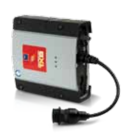
NAVIGATOR TXB → 🚚 🚜 👞